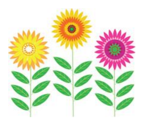
HAPPY MOTHER'S DAY